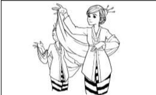
cultural shows – singing – traditional dances