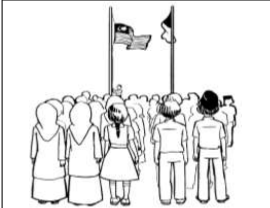
raising flag – sing – National Anthem – patriotic songs