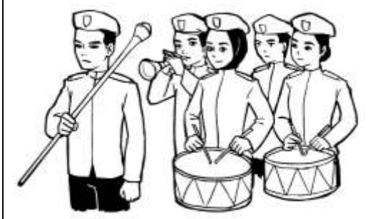
march – school band

Your school held a grand National Day celebration this year. Write a report for the English Language Newsletter.